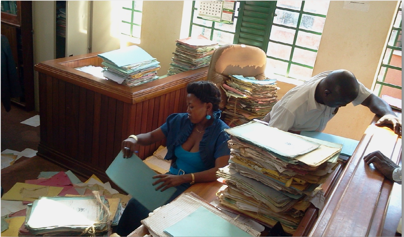
Inset: High Court Staff helping in the backlog weeding process.